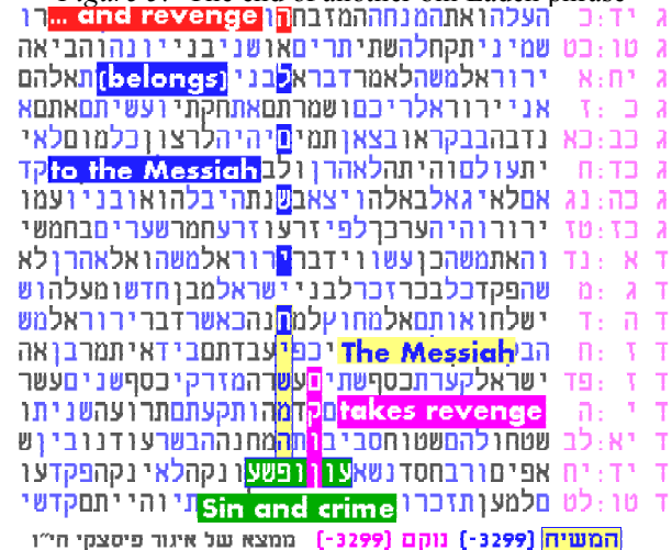
Figure 5a: Continuation of figure 5 using half width

There are at least four alternative ways to create openly verifiable codes: